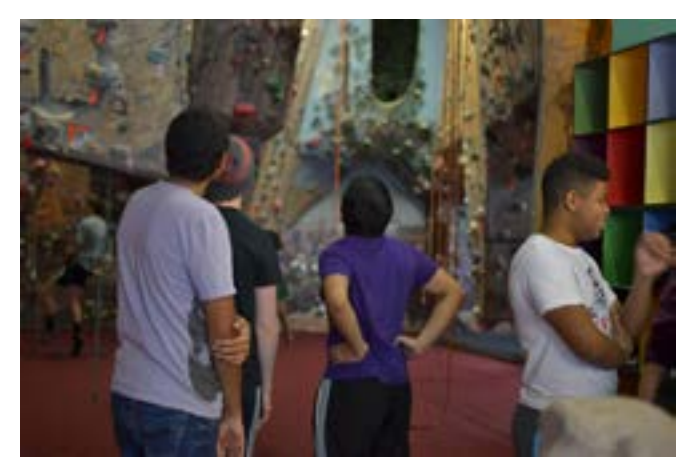
Brothers and rushees rock climbing.

On Thursday we went to ECAV to play dodgeball. Saturday brought our invite trip: snow tubing at West Mountain. On Sunday Brothers and rushees gathered to watch the Superbowl in the rec room. We provided wings and pizza, and Brotherhood organized a bet for some friendly competition. The bid dinner on Tuesday marked the end of Spring Rush, with six pledges to show for it.