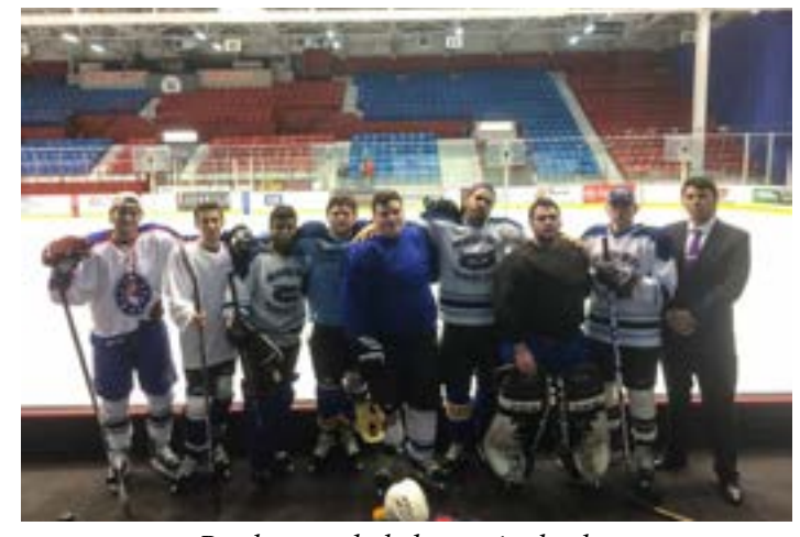
Brothers and pledges at ice hockey