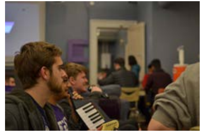
Brothers and rushees hanging out at Games Night